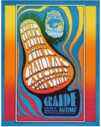
Gorgeous Rational's Poster

The Grande series, in the beginning, had quite a few posters (and many handbills), but over time, the accent on posters was replaced by a greater use of the postcards, as Detroit did not have that many places at the time to display posters. So the posters gave way to the cards and many of these cards are still available to collectors today. The posters on the other hand are already somewhat rare and some of the handbills are so rare that there may be but one known copy.